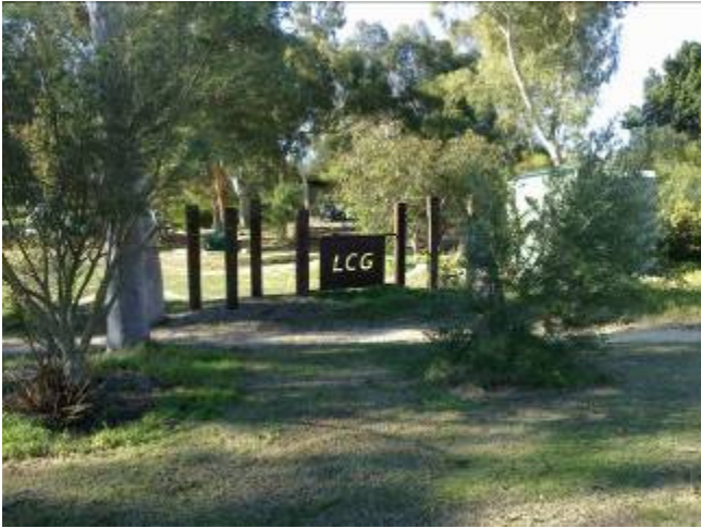
Signage is important for promotion.