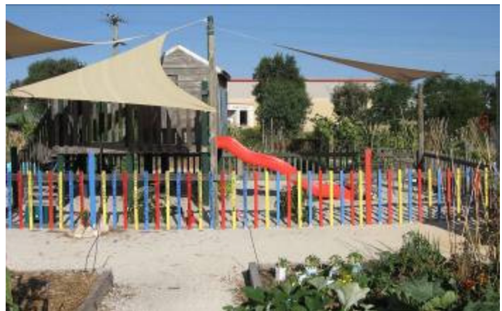
Extensive children's play area.