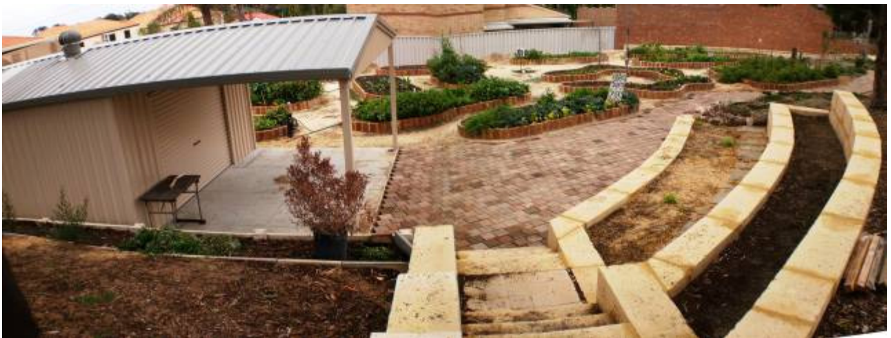
Panoramic view of garden area.