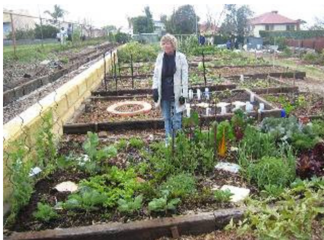
West Leederville Community Garden.