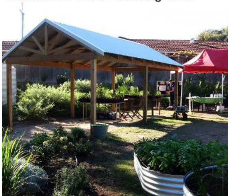
St Lukes Mosman Park Undercover work / meeting area

Type: The garden was established in 2009 by members of the parish of Mosman Park. Raised garden plots are available to local residents and the gardeners are a wealth of knowledge on companion planting, organic practices, composting, mulching and native plants. There is also an op-shop and café to enjoy in one of the adjoining Church buildings.