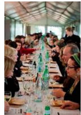
Highlights of the Truffle Festival