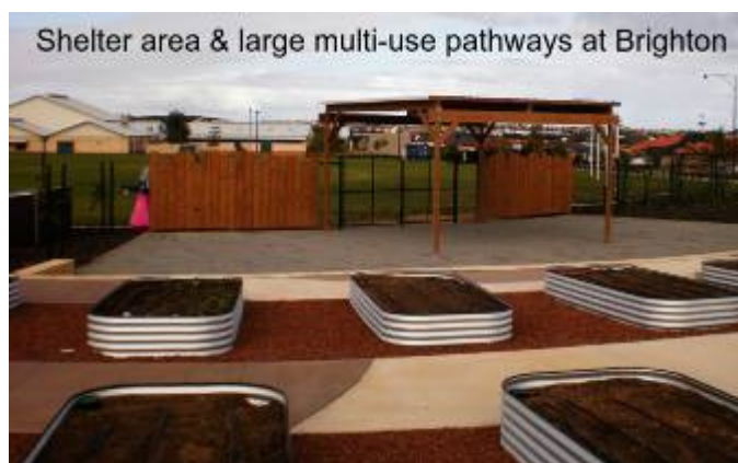
Shelter area & large multi-use pathways at Brighton