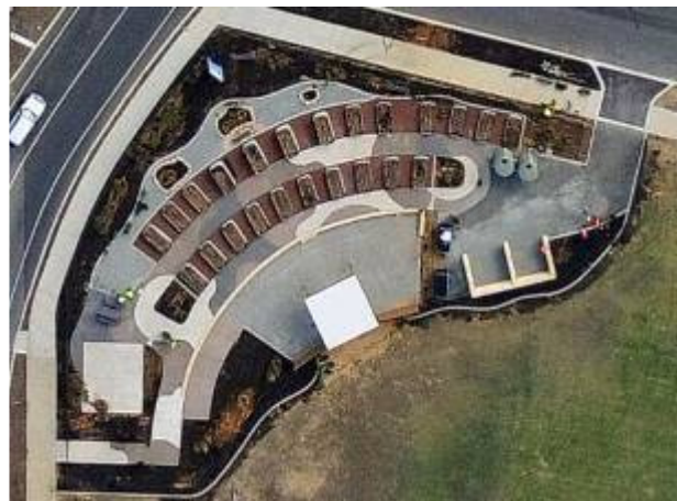
Garden development as at June 2011.