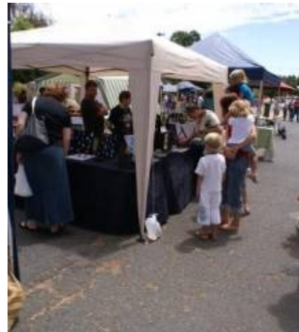
A selection of photos of the monthly Mundaring Markets, opposite the Station Master's House.