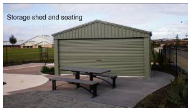
Storage shed and seating