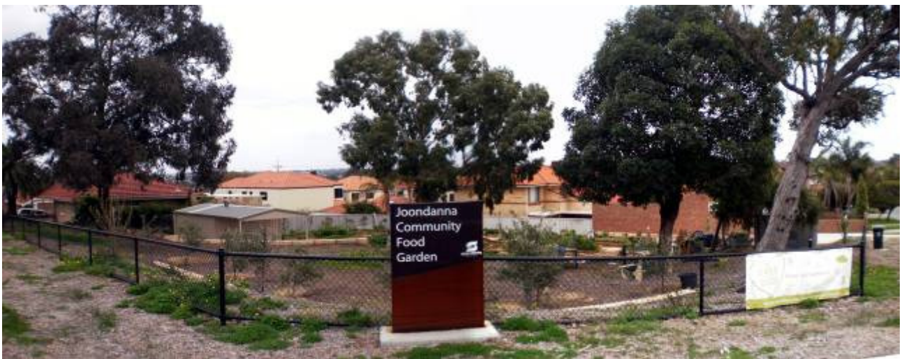
Garden is well maintained, with prominent signage.