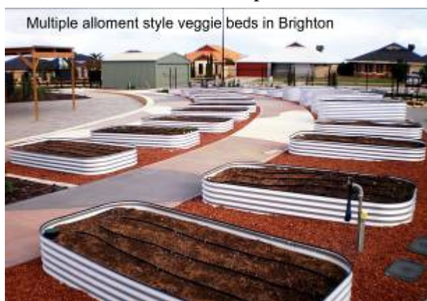
Multiple allotment style veggie beds in Brighton