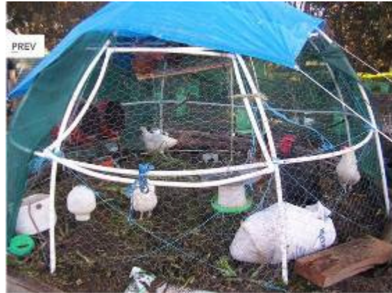
Chickens, guinea pigs and rabbits are all kept on site.