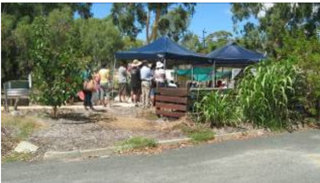
(Above and right) Training and workshops are ideal ways of teaching others about gardening.