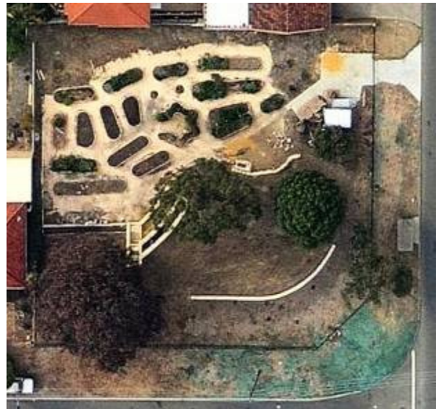
Development as at June 2011.