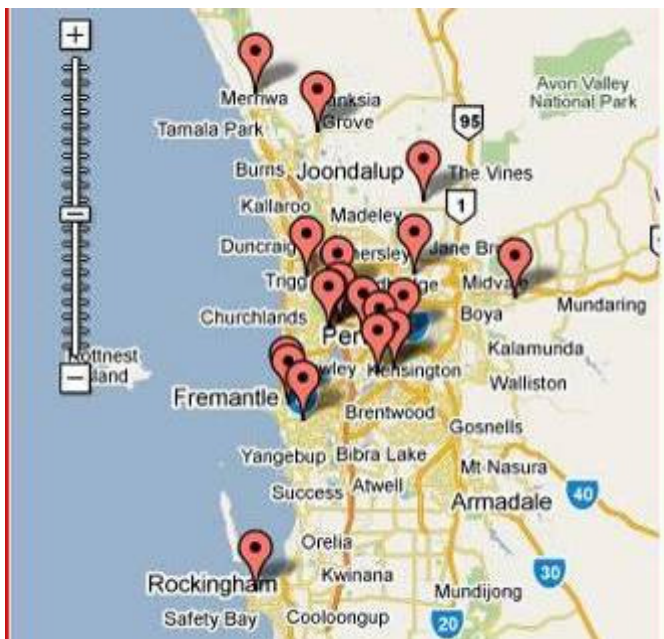
Some of the locations of community gardens in the Peth metropolitan area.