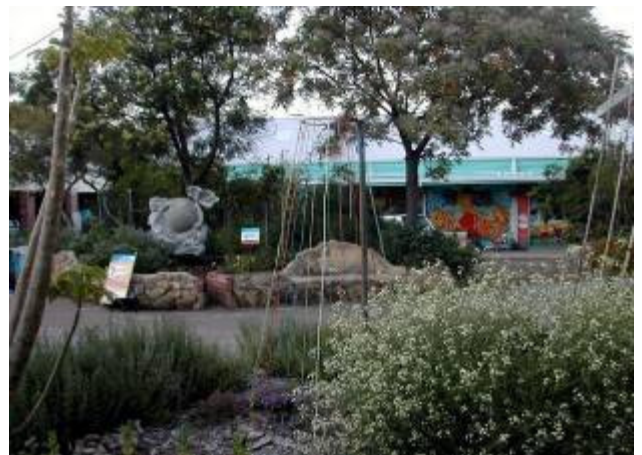
Before (Above) and Now (R)