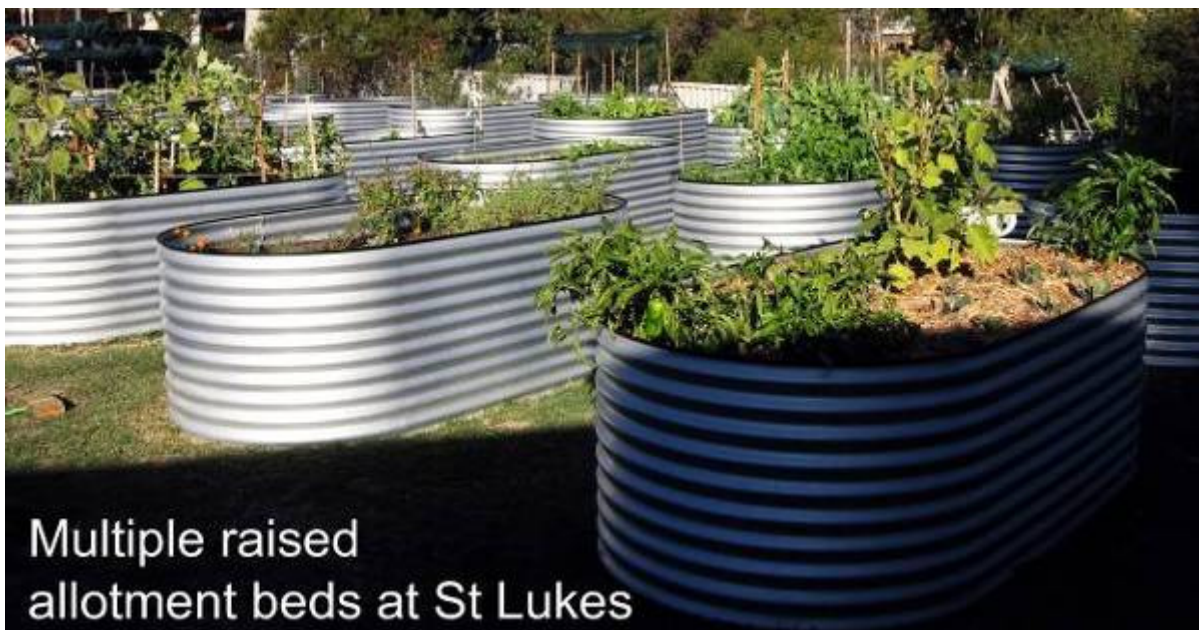
Multiple raised allotment beds at St Lukes