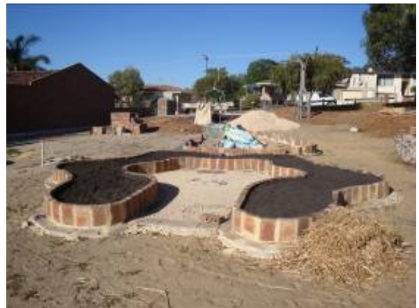
Early stages of development.