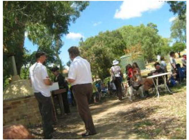
Regular get-togethers build community spirit.